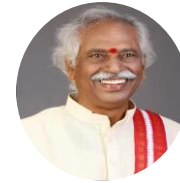
Shri Bandaru Dattatreya Hon'ble Chancellor & Governor Haryana